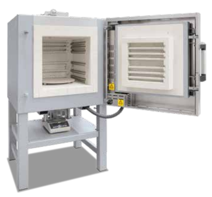
Chamber furnace LH 60/12 SW with scale to measure weight reduction during annealing \,