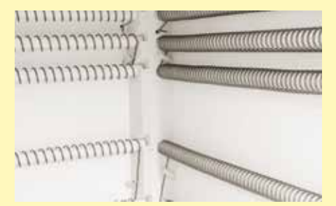
LF furnace design provides for shorter heating and cooling times