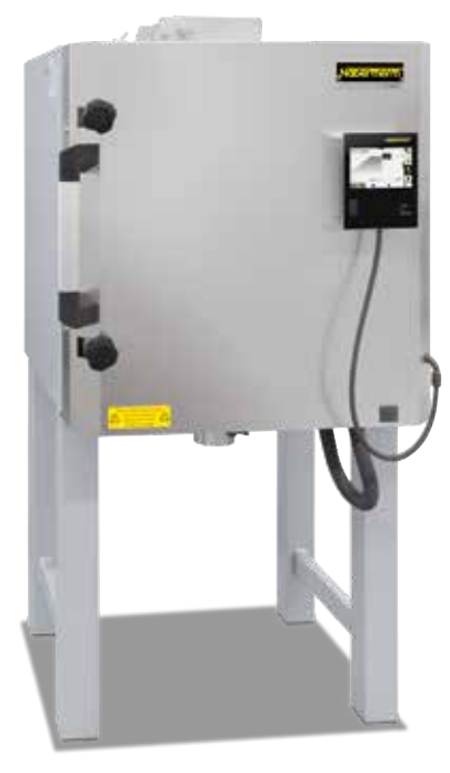
Chamber furnace LH 30/14

These big chamber furnaces LH 15/12 - LF 120/14 have been trusted for many years as professional chamber furnaces for the laboratory. These furnaces are available with either a robust insulation of light refractory bricks (LH models) or with a combination insulation of refractory bricks in the corners and low heat storage, quickly cooling fiber material (LF models). With a wide variety of optional equipment, these chamber furnaces can be optimally adapted to your processes.