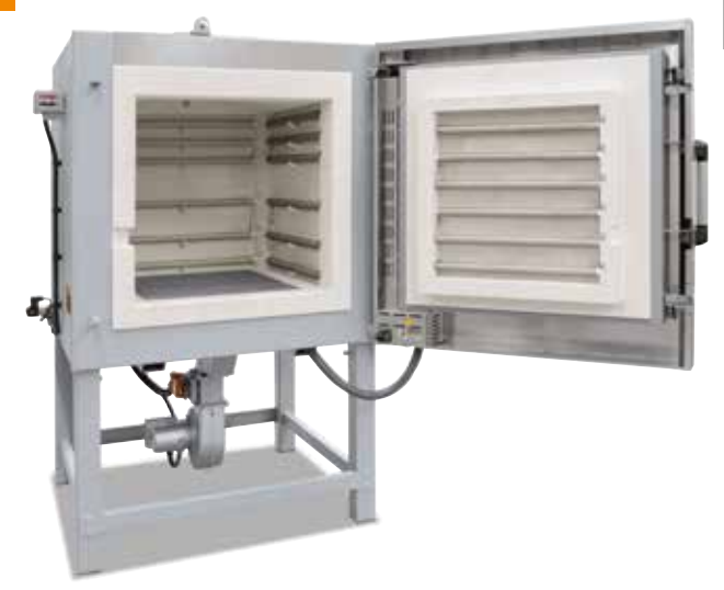
Chamber furnace LH 216/12 with fresh air fan to accelerate the cooling