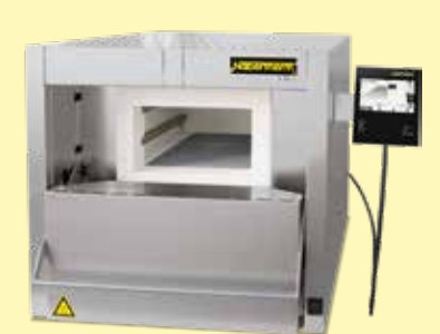
Chamber furnace N 7/H as table-top model