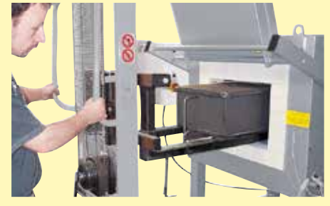
Working with protective gas boxes for a protective gas atmosphere using a charging cart