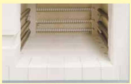
Model with brick base