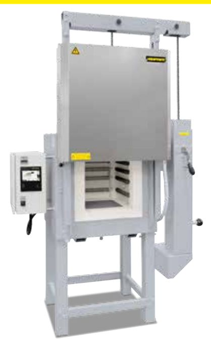
Chamber furnace LH 30/12 with manual lift door