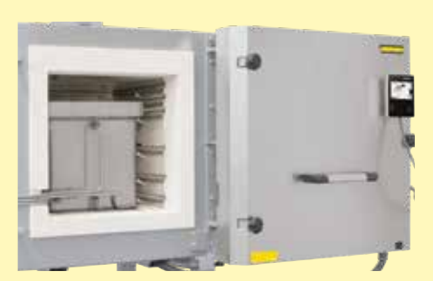
Parallel swinging door for opening when hot